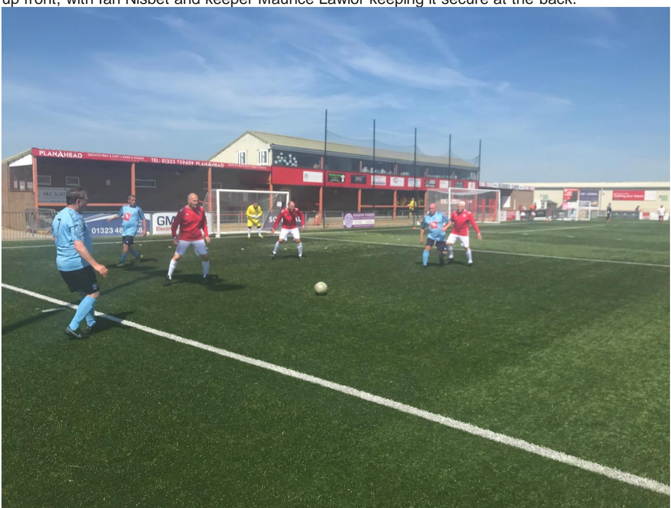
Borough Blue versus the South-east England Over 70 side

up front, with Ian Nisbet and keeper Maurice Lawlor keeping it secure at the back.